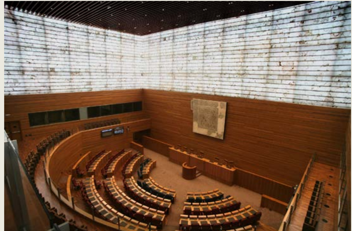
Cortes Castilla y León

Our experience in architecture is measured in built works. We ensure that each alabaster panel is integrated with quality and precision. For unique projects with their own light.