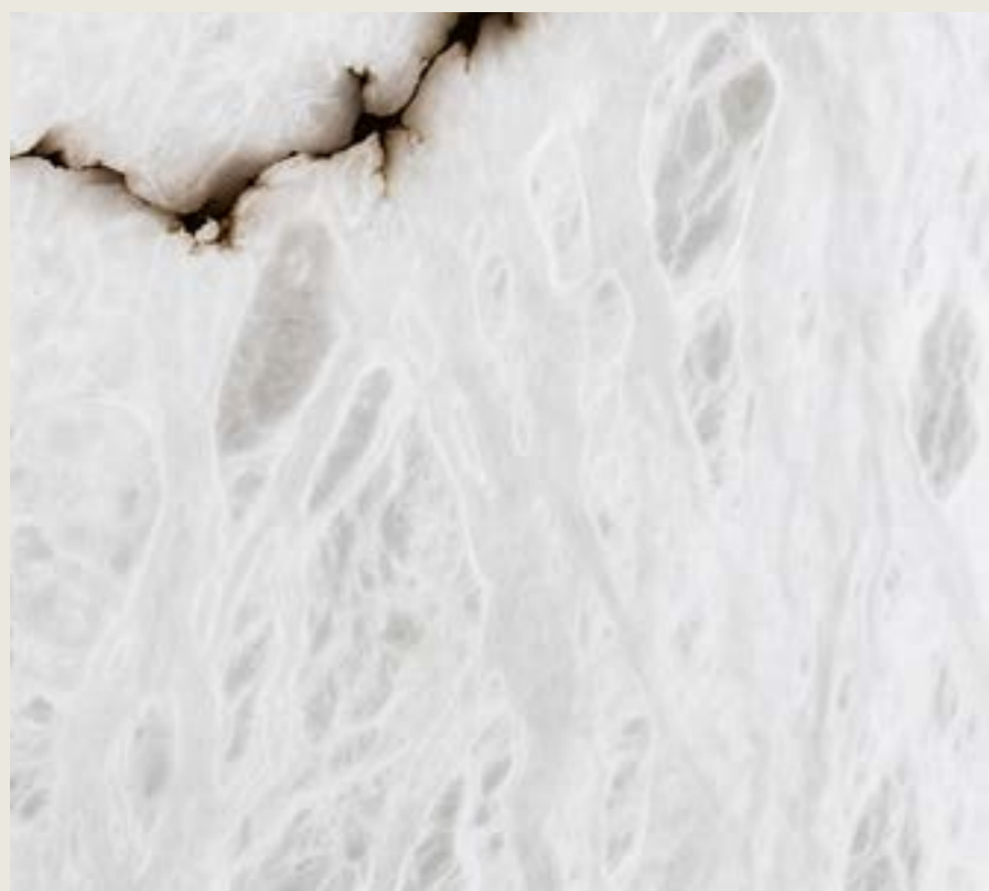
EBRO Recognized for its milky translucency and veining in earthy and grayish tones.

We select the appropriate veining for each project.