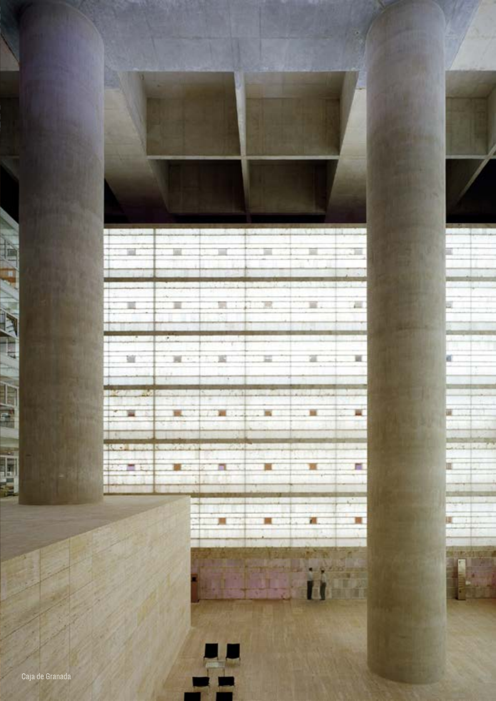
Caja de Granada