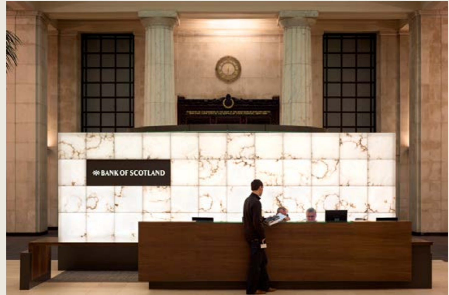
Bank of Scotland