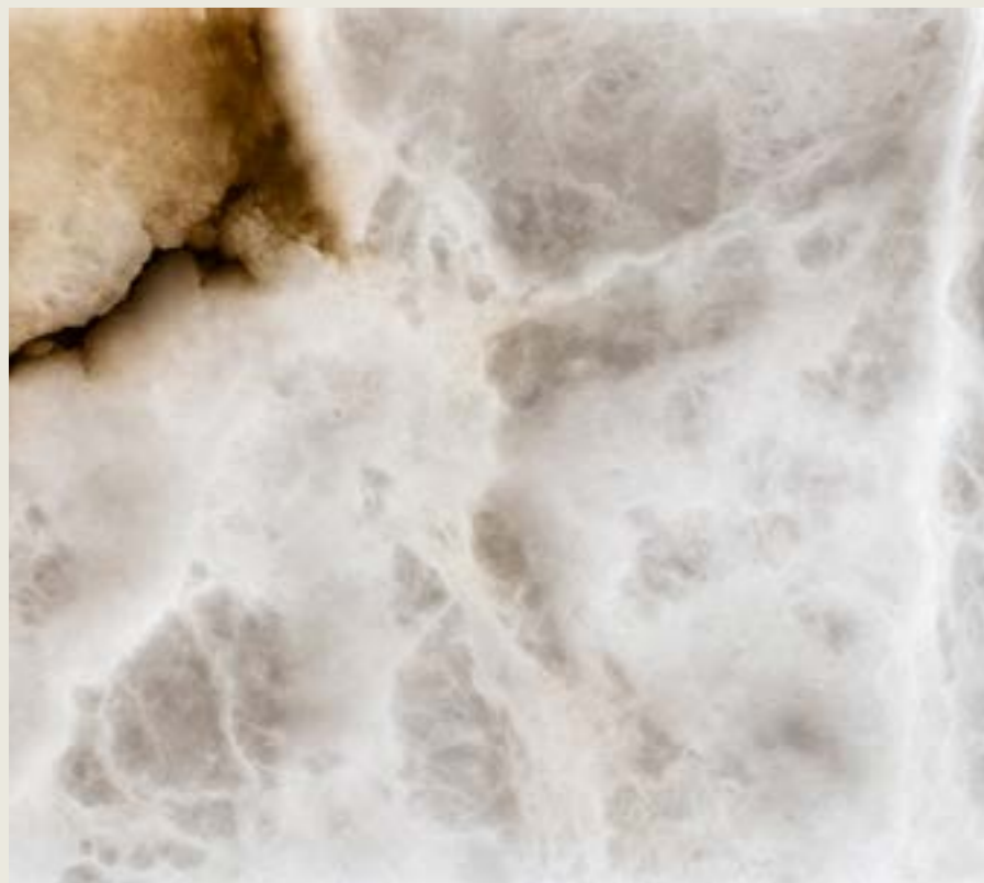
ZAIDA Selected for its exceptional snow-white translucency, reddish earth-toned veining and subtle cloud-like textures.

Currently, we commercialize 2 alabaster varieties: