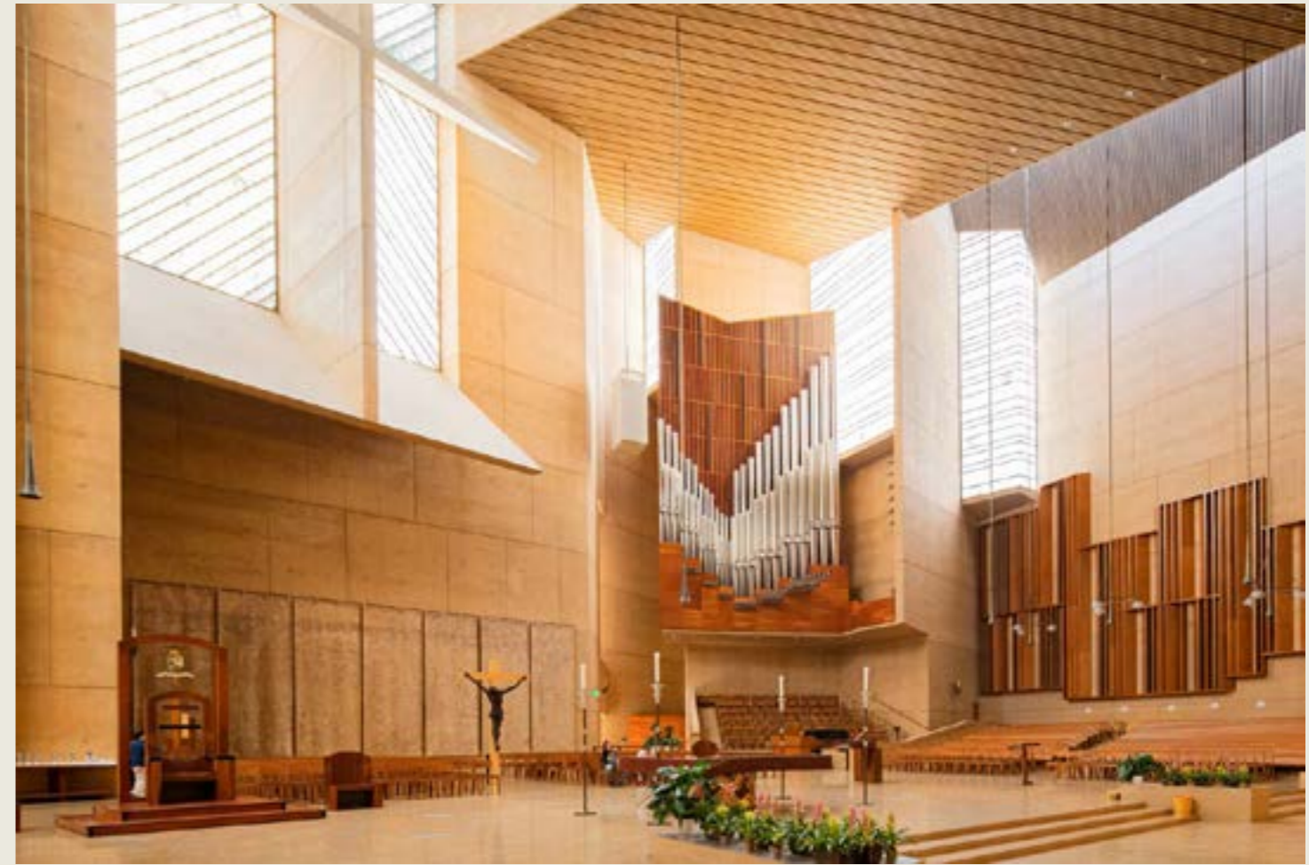
Los Angeles Cathedral